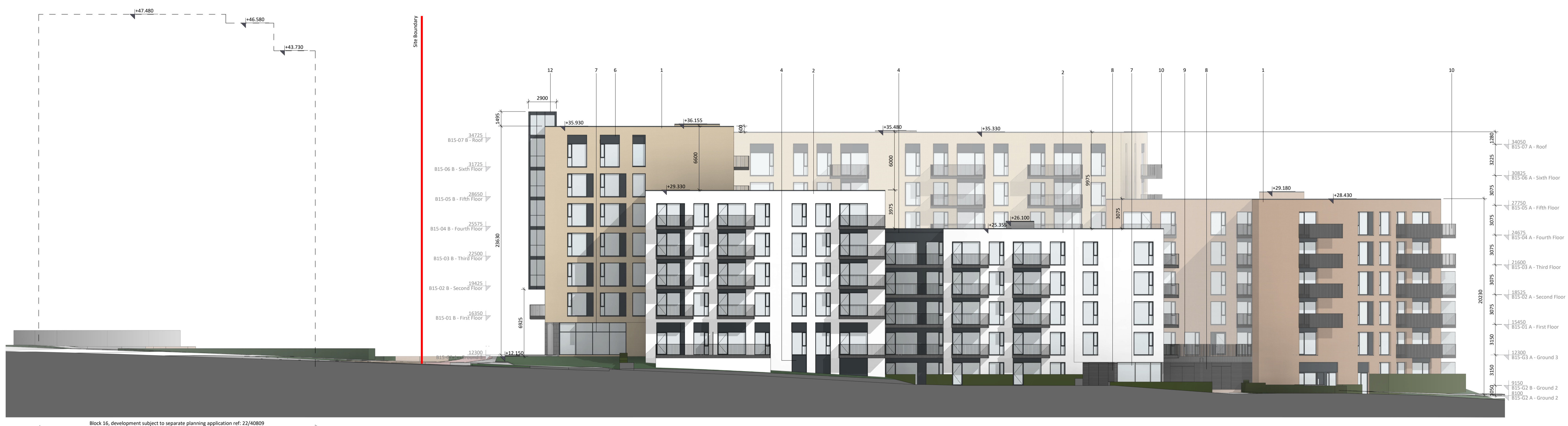
1 B15-South West Elevation 1:200