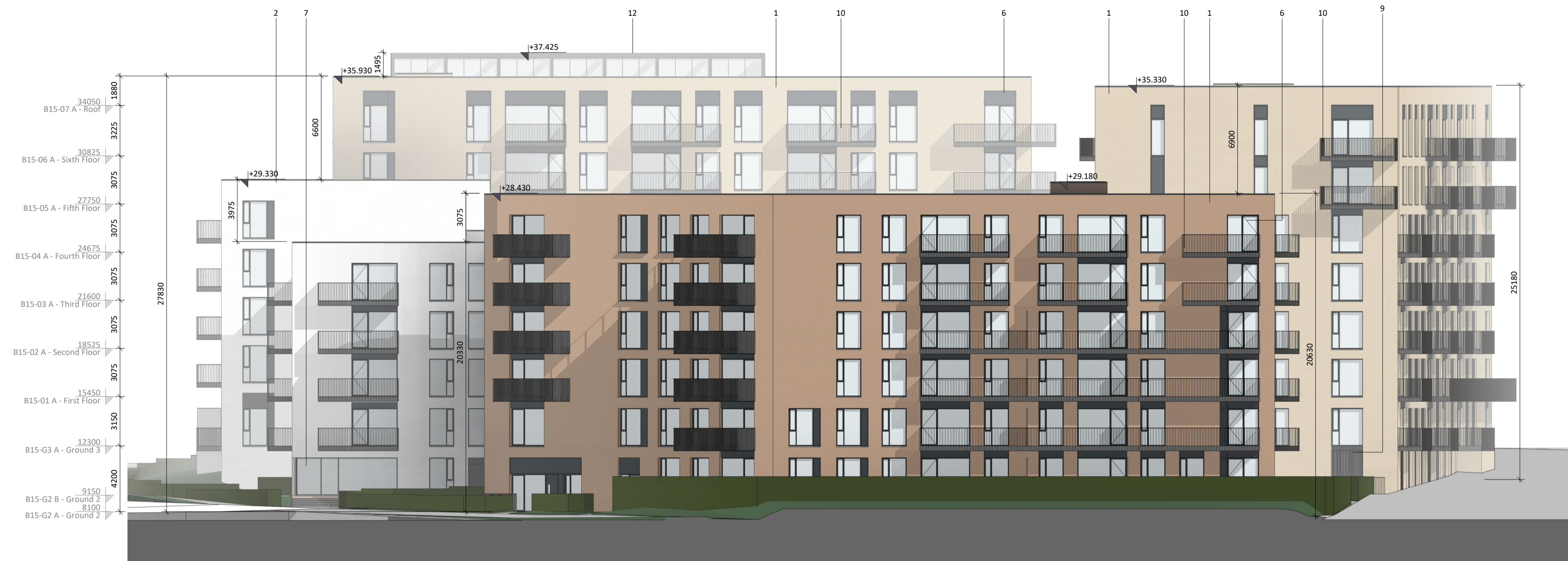
2 B15-South East Elevation 1:200